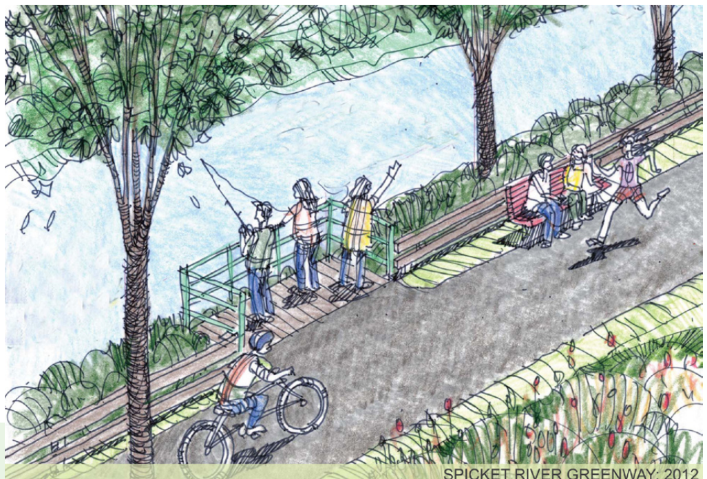
SPICKET RIVER GREENWAY: 2012

A $2.6 million Commonwealth's Gateway City Parks grant has provided the means to finalize the design and construction of the 2.5-mile Spicket River Greenway.