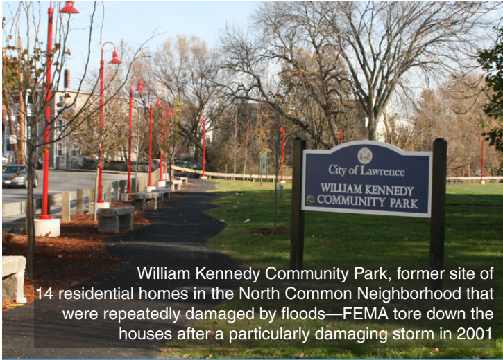
William Kennedy Community Park, former site of 14 residential homes in the North Common Neighborhood that were repeatedly damaged by floods—FEMA tore down the houses after a particularly damaging storm in 2001

The former Covanta incinerator facility, located within a 19th Century mill complex on Stevens Pond and the Spicket River burnt municipal trash for nearly 20 years. At its peak of operation, the facility emitted 800 pounds of mercury and 400 pounds of lead each year. The highest rate of childhood lead exposure and the second highest rate of childhood asthma in the Commonwealth are found in Lawrence.