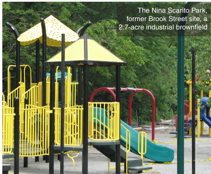
The Nina Scarito Park, former Brook Street site, a 2.7-acre industrial brownfield

In concert with the riverfront awareness and restoration efforts, several vacant lots and brownfields along the river have been transformed into open space, community parks and community gardens. The Dr. Nina Scarito Park (Scarito Park), named in honor of a local obstetrician, was the first brownfield-to-open space project completed in 2006. This neighborhood park