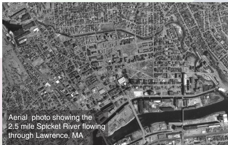
Aerial photo showing the 2.5 mile Spicket River flowing through Lawrence, MA

A former textile mill manufacturing city first incorporated in 1856, Lawrence, Massachusetts is a Gulf of Maine Watershed community located just north of Boston where the Merrimack, Shawsheen and Spicket Rivers converge. The Spicket originates in Salem, New