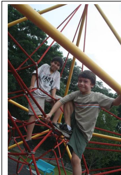
Young kids at Manchester Street Park

Create trails and linkages between trails along the waterways including the canals.